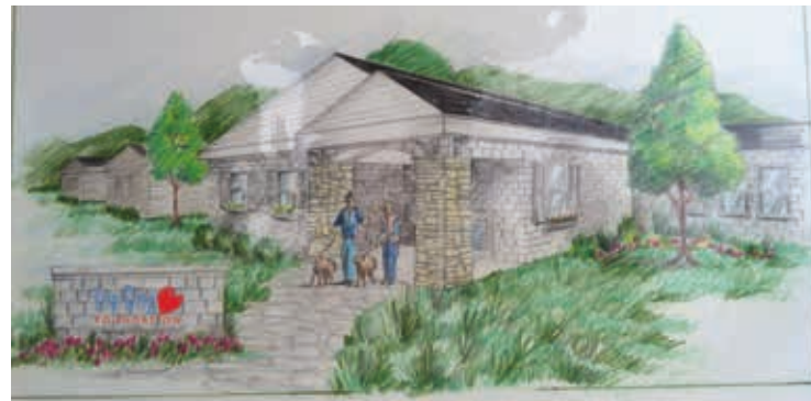
Top Dog Foundation Sanctuary Elevation