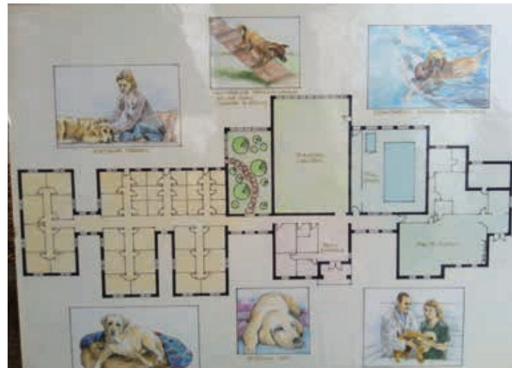
Top Dog Foundation Sanctuary Floor Plan